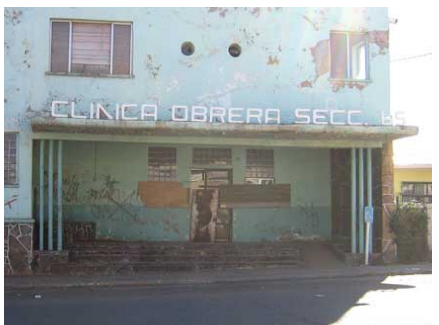
Workers clinic shuttered by Grupo Mexico bosses after defeat of 1999 miners strike.

The former head of the SNTMMSRM, Napoleón Gómez Sada, father of the current president, Napoleón Gómez Urrutia, always functioned as a government man, the rightful heir to the founder of the corporatized mining union, Jesús Carrasco, in the 1940s. Thus, for example, one of the principle demands of the current miners' strike in Cananea is for the reopening of the workers' clinic, closed by the bosses after the defeat of the 1999 strike, when the national miners' "union" not only failed to support the