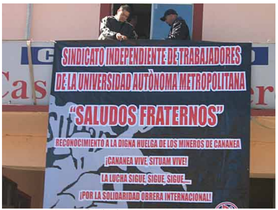
Workers hang banner of solidarity greetings from Union of Workers of the Metropolitan Autonomous University (SITUAM) to striking Cananea miners, December 2007.

This, in turn, requires a struggle for complete independence of the working class from the bourgeoisie, its parties, its strong men, and its state. It's not enough to just struggle