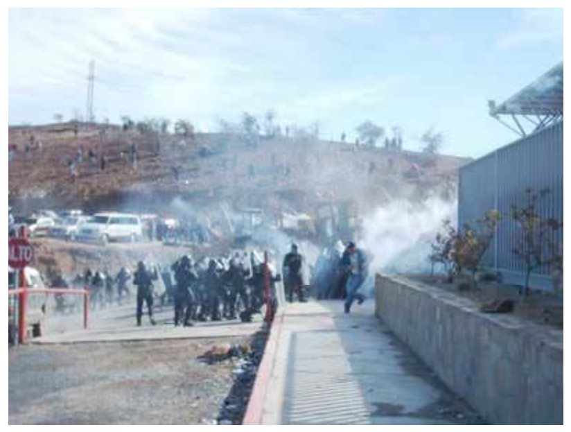
An army of at least 800 federal and state police and Mexican army troops that assaulted the six-month-old strike by copper miners at Cananea, in the northern state of Sonora, January 11.

The federal government has repeatedly used Mexico's corporatist labor laws, modeled on the labor code of Mussolini's fascist Italy, to outlaw the miners' strike. Although courts have issued injunctions against the JFCyA rulings, the state