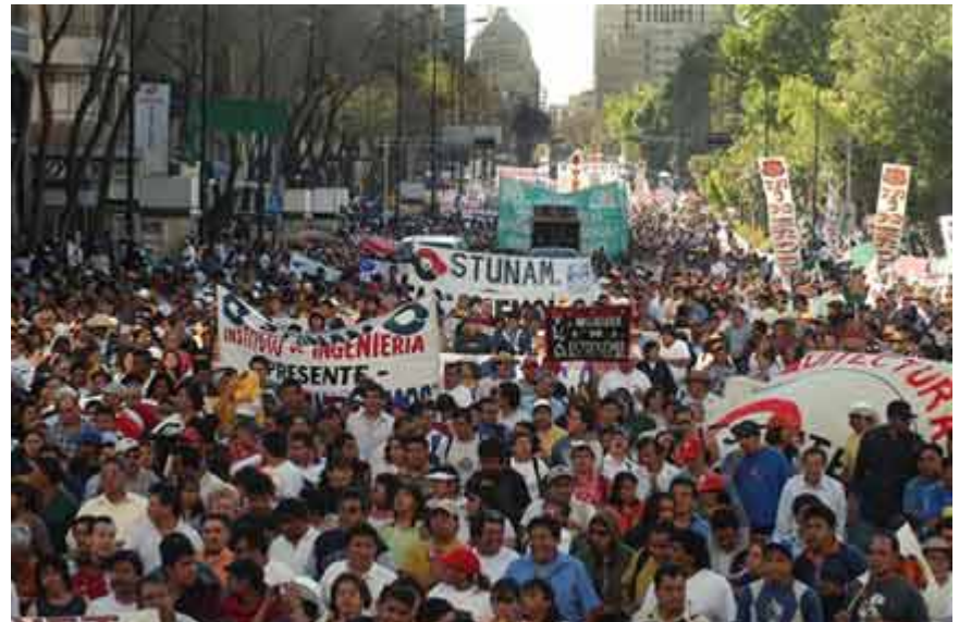
March in solidarity with miners, Mexico City, 6 March 2006. Today a national strike is urgently needed to support striking miners.

The fact that we oppose bourgeois repression does not change the bourgeois character of the corporatist aparatus one bit, nor does it postpone the struggle to replace the corporatist unions with genuine workers' organizations. To make a truce with the charro bureaucracy condemns the struggle against anti-working class persecution to failure, because in the final analysis these cogs of the capitalist state machinery take their orders from their bourgeois masters.