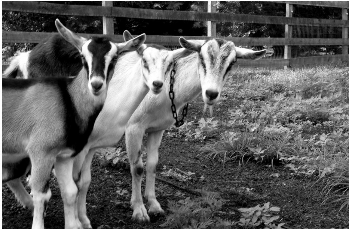
Goats are used for their milk to make cheese and for weed control at the farm.

Milk and Eggs Program: Besides all the work that they do that increases yield for row crops, animals provide essential protein foods such as milk and eggs. Garden Harvest does not raise animals for slaughter, as we respect all beings right to live and these animals produce plenty of high quality protein foods in the form of milk