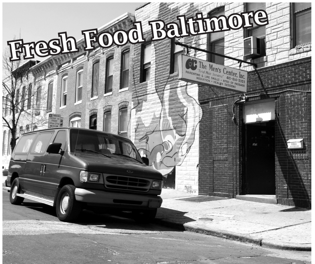
The Fresh Food van and East Baltimore's Men's Center are an important part of the project, but only community participation can make it work.