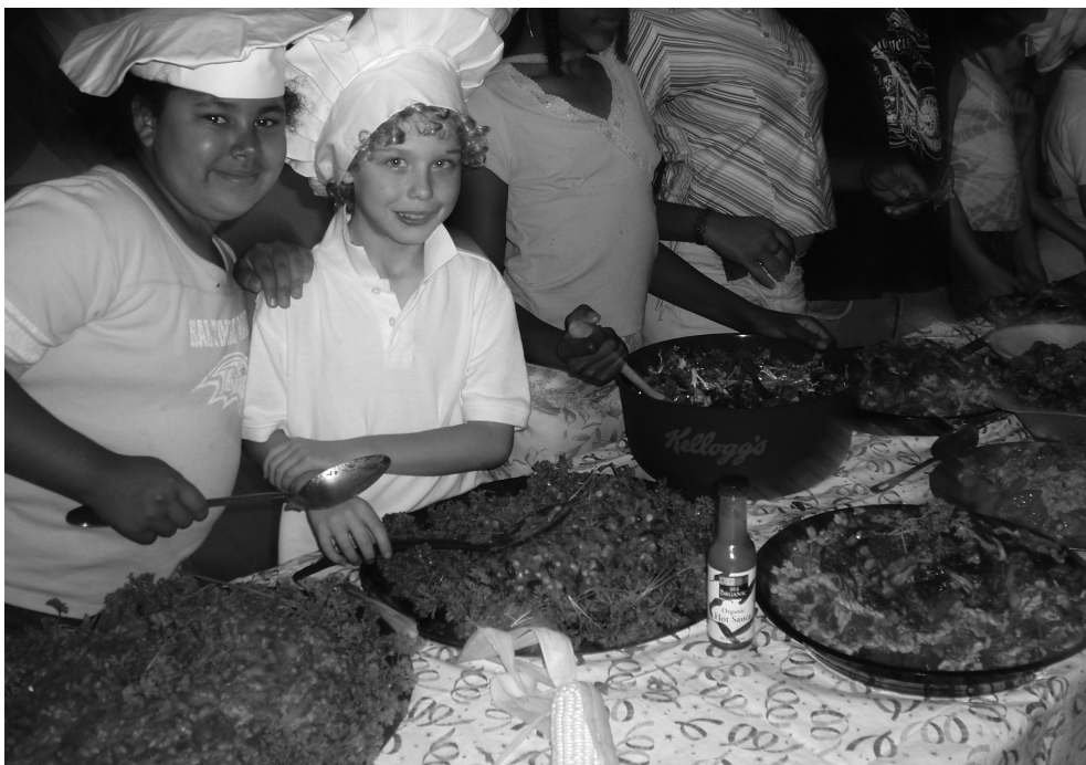
Hampstead Hill Academy Students in the Food for Life program prepared their first Community Dinner in April 2005.

Healthier nutrition for families is another goal. Recipes are sent home with students so that they can prepare meals for their families.