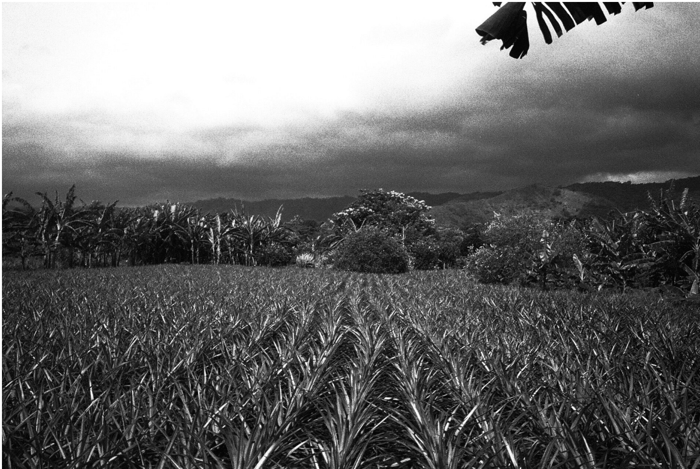
A field in the pineapple cooperative of Ticuantepe, Nicaragua.

Beans and rice. Beans and rice. For two weeks we ate beans and rice with every meal. Well, no - there were probably a few breakfasts in there when we didn't - but the fact that I can't remember them illustrates my point: we ate a lot of beans and rice. "The beans will give you strength," we were told. And we certainly needed it; we were working with an experienced team of gritty, bantering masons building cinder-block houses in a small rural town called Ticuantepe near the capital city of Nicaragua. Our group, which was comprised of 5 graduates from the Maryland Institute College of Art's Community Art Masters Program and 6 high school students from the Academy of Career and College Exploration (ACCE), was there for 2 weeks on a cultural-exchange / service trip through Bridges to Community, a non-profit organization dedicated to building solidarity with international communities. We worked with the masons and we ate with them - along with the rest of the residents, cooks, and children living in the pineapple cooperative where we were staying.