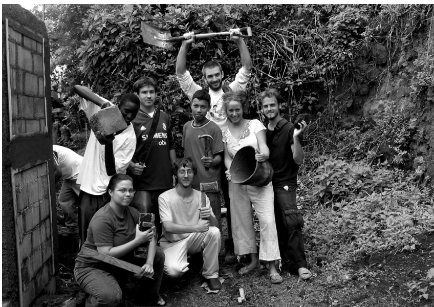
Members of the Bridges to Community Group build houses in Ticuantepe.