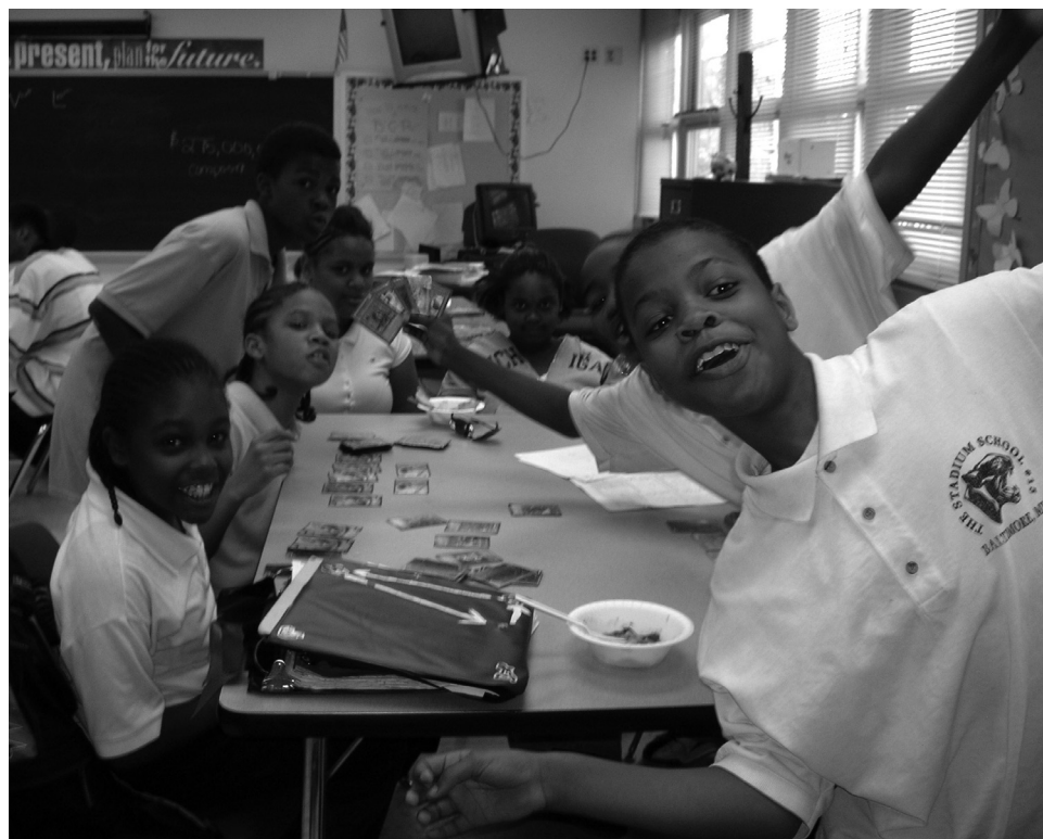
"Food for Life" students at the the Stadium School.