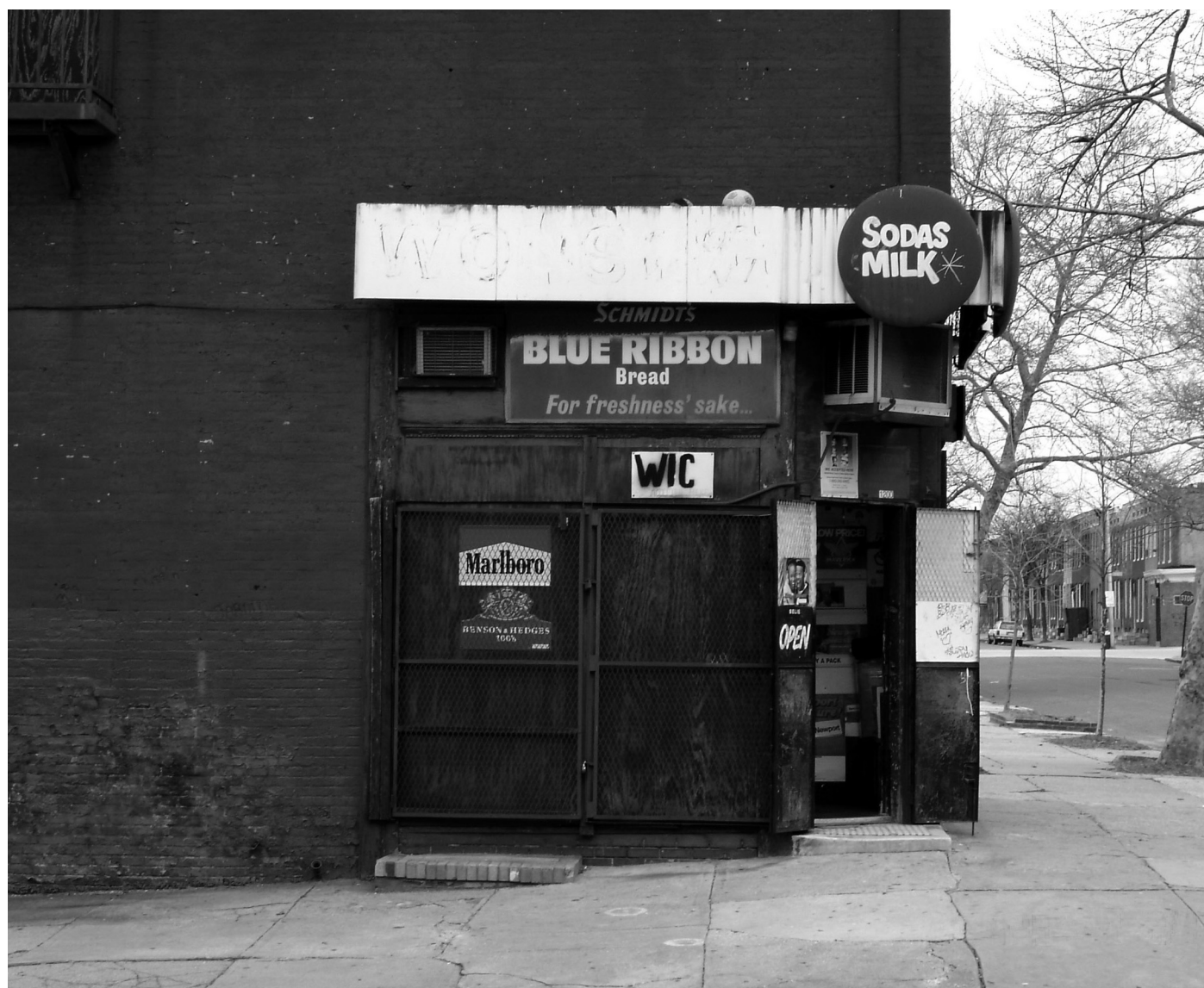
This East Baltimore Corner Store is one of the many that have agreed to participate in the Healthy Stores Project.

Any one person's risk for these chronic diseases includes a combination of social, economic, genetic and environmental factors, such as access to affordable, healthy food, and physical activity, clearly play a critical role. According to the Baltimore Sun (5/21/02), 15 percent of supermarkets—which are often a source of fresh produce and quality meat and fish—closed shop between 2000 and 2003 leaving less than 60 supermarkets to serve more than 635,000 residents (2). As a result, low-income residents, with limited means of transportation to faraway supermarkets, rely on small local stores (3). While local stores are convenient, they offer a limited selection of foods at higher prices than