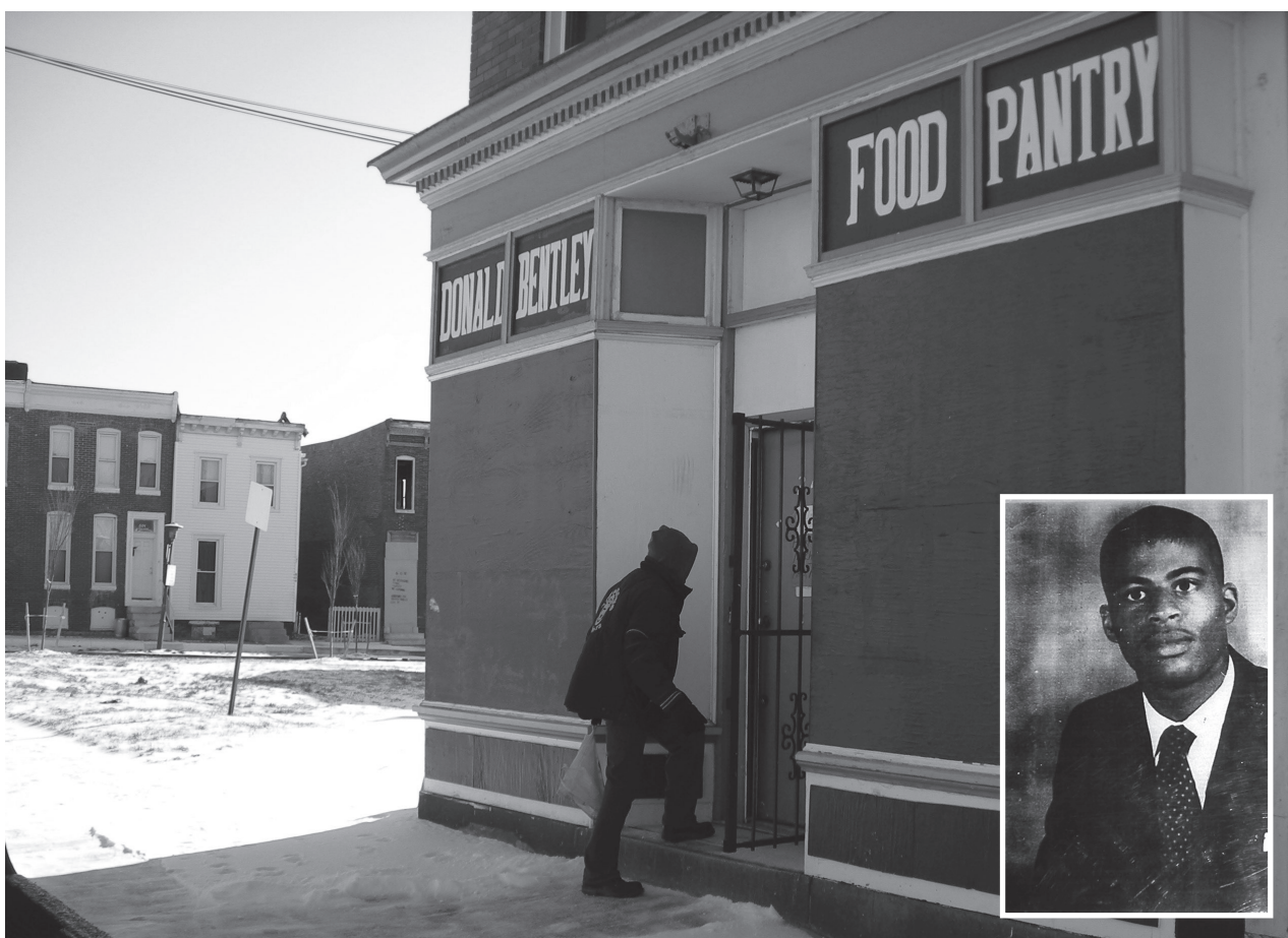
The Donald Bentley Student Memorial Food Pantry 2405 Loch Raven Blvd.